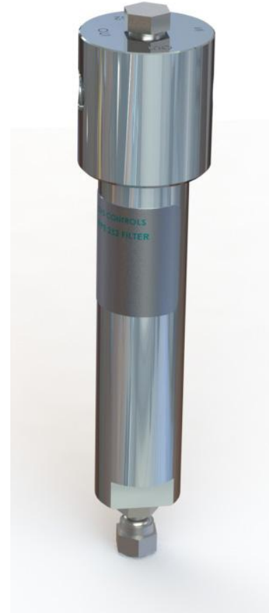
CVS Series 252 Filter

NACE Compatible. Providing a filtration capability of 20 microns. Maximum working pressure of 2750 psig.