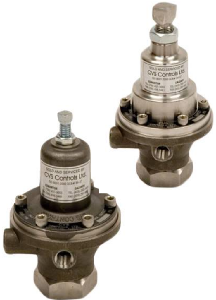
Figure 1: CVS Type 1301F and CVS Type 1301G Regulator

The CVS Type 1301F is available in three spring ranges to provide outlet pressures to 225 psig (15.5 bar). CVS Type 1301G provides outlet pressures to 500 psig (34.5 bar) in one spring range. Inlet pressures can range up to 6000 psig (411 bar).