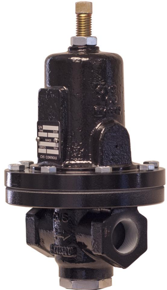
CVS Series 95H Regulator

Body materials available are cast iron, steel and stainless steel. Body sizes available are 3/4" and 1" NPT with 9/16" orifice.