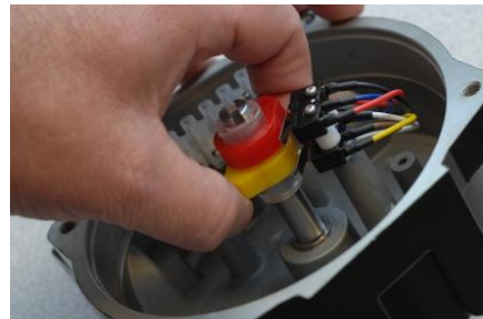
Yellow Cam Adjustment – Fully Open

CVS Controls Ltd. strives for the highest levels of quality and accuracy. The information included in this publication is presented for informational purposes only. CVS Controls Ltd. reserves the right to modify or change, and improve design, process, and specifications without written notice. Under no circumstance is the information contained to be interpreted to be a guarantee/warranty with regard to our products or services, applicability or use.