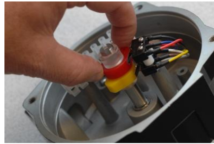
Red Cam Adjustment – Fully Closed