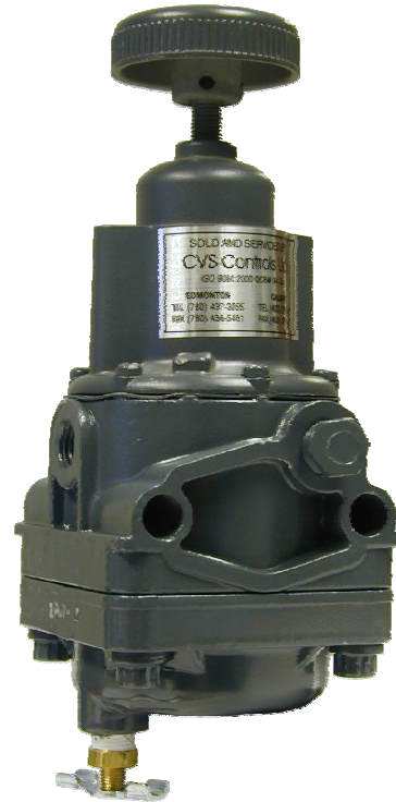
Figure 1: CVS Type 67AFR Regulator

In addition, these regulators contain integral low-capacity relief valves. In this type of construction the valve stem