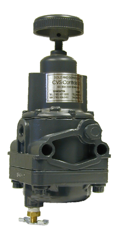
Figure 1: CVS Type 67AFR Regulator

In addition, these regulators contain integral lowcapacity relief valves. In this type of construction the valve stem